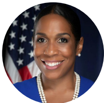
Juliana Stratton Lt. Governor of Illinois